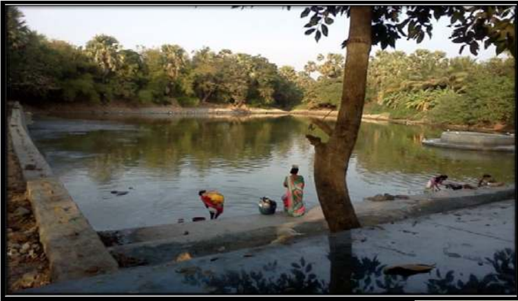
Karjadevi Talao, Manori,

The team working on 'Preservation & Restoration of Water Bodies and Beaches' prepared a case study on status of water bodies in P-North Ward, MCGM's largest ward (area-wise). They also prepared a booklet to guide citizens on what they can do to save, protect & conserve water bodies.