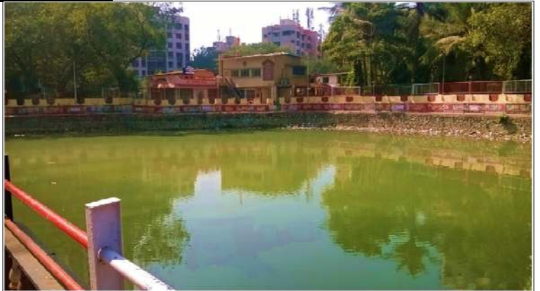
Bhaujale Talao / Somwar Bazaar Talao, Link Road, Malad West