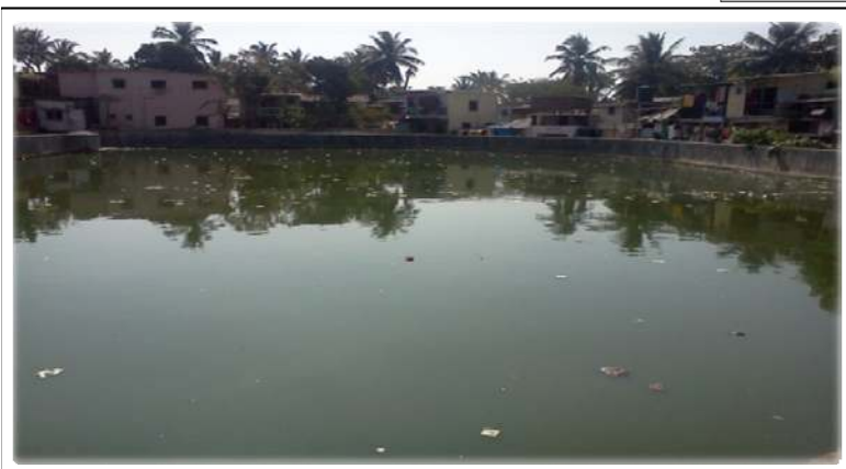
Malwani Talao, near Malwani church, Malad