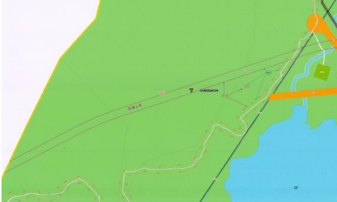
Annexure 1: Snapshot of Draft DP 2034 with areas around Vihar lake marked as Natural Areas